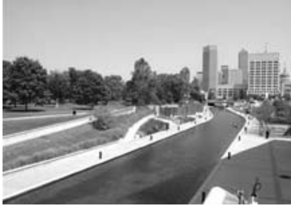
White River State Park